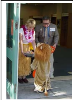
A lion roars for treats at Everything In Sight Optical

If you are a business wishing to participate in this event, please contact the Network. We'll place Trick-or-Treat posters at participating businesses with maps inside to guide participants on their trek.